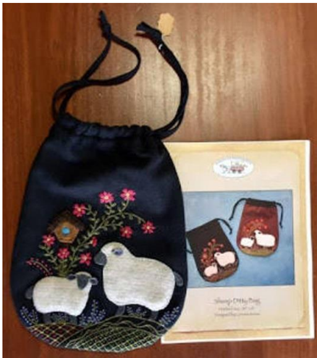
Sheep Ditty Bag (October 2019)