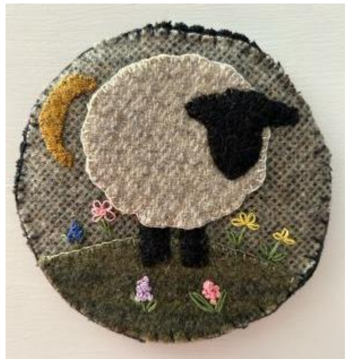
Sheep Needle Keep (May 2023)